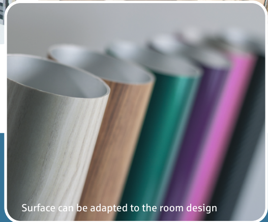
Surface can be adapted to the room design